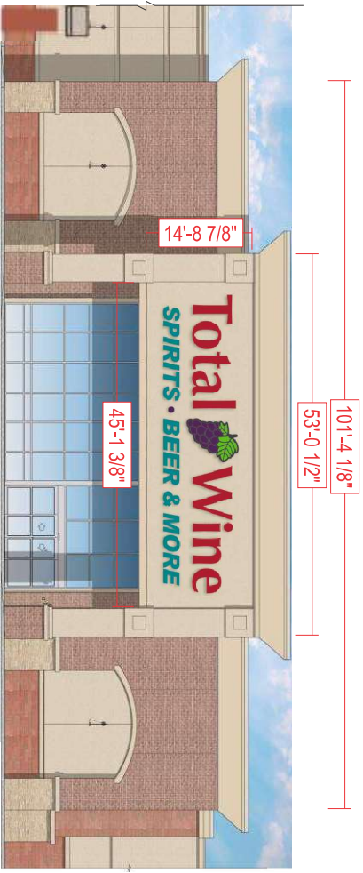
WALL SPACE TO BE VERIFIED BEFORE PRODUCTION