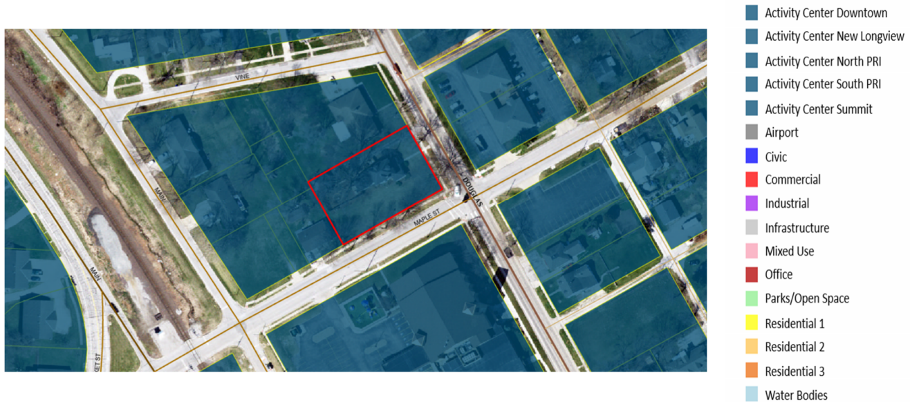
Figure 4 – Future Land Use Map & Legend

The Ignite! Comprehensive Plan promotes various strategies to build long-term economic prosperity and resiliency in the City's economy. One objective established in the Comprehensive Plan is to increase business retention and grow business activity. Also, the future land use plan within the Ignite! Comprehensive Plan denotes the subject property as part of the Downtown Activity Center which states office uses as complementary. Approval of the subject Rezoning and PDP applications to allow a business office on the subject property supports continued economic viability of the site by growing business activity.