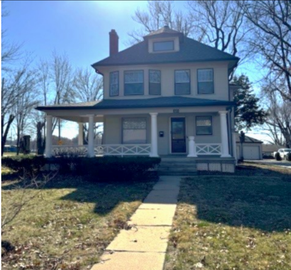
Figure 1 – Existing single-family house