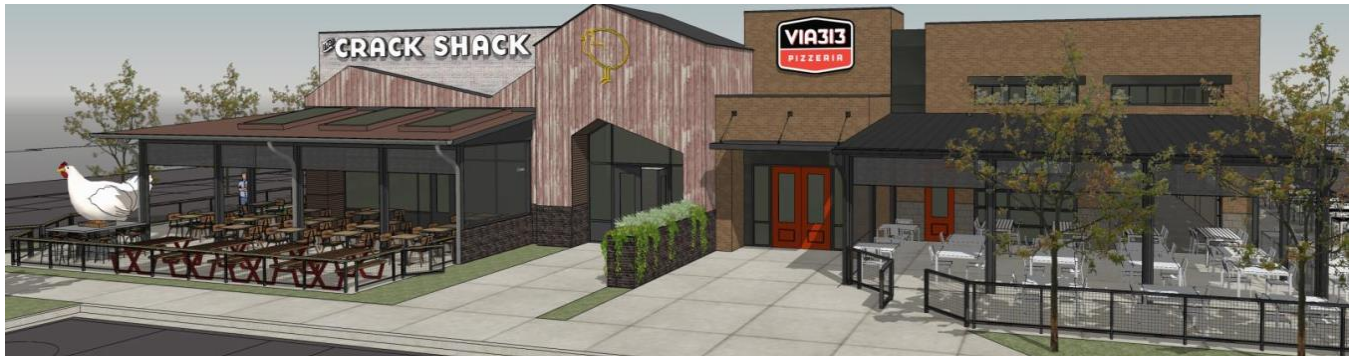
Figure 2 - Proposed front building elevation.