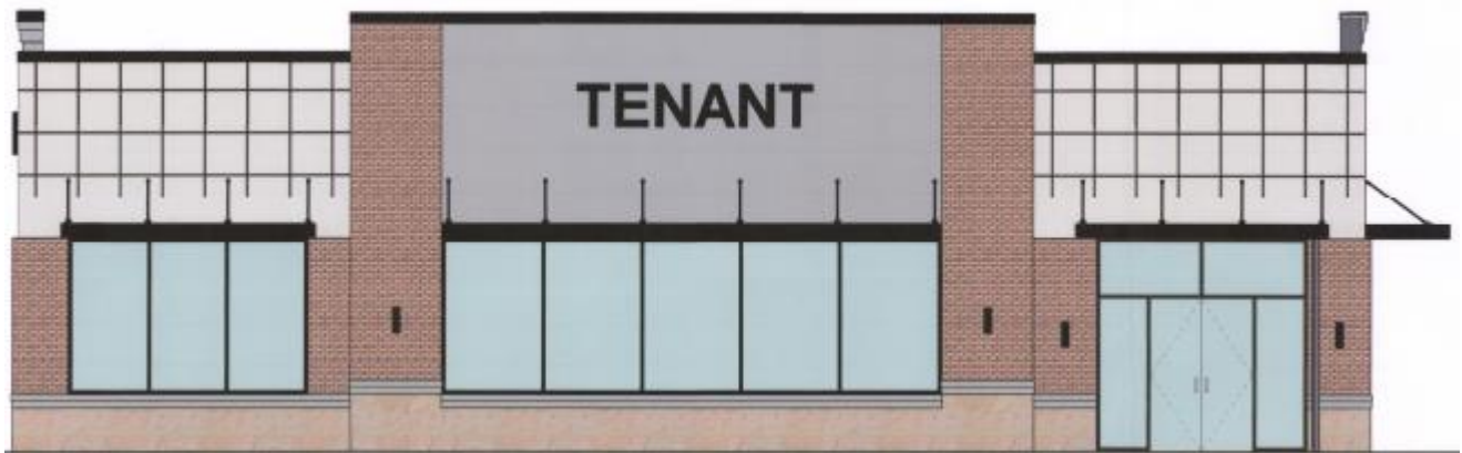
Figure 1 - Previously approved typical commercial front elevation.

The architectural deviation from the previously approved plan necessitating a new preliminary development plan approval is related to the difference in building form and aesthetic. The proposed building architecture employs a specific look for each of the two building tenants. The Crack Shack’s exterior has a roadhouse-like architectural look that uses distressed/weathered wood and a white-washed masonry veneer to convey a rustic feel to the fried chicken restaurant. The Via 313 Pizzeria’s exterior has a traditional urban commercial/warehouse-like architectural look that primarily uses brick veneer, a significant amount of glass and some metal. Staff supports the proposed building architecture for both restaurant users. The deviation from the previously approved typical architectural style allows each user to express their own architectural language in a manner that creates a unique sense of place and contributes to the architectural interest of the larger development. The images below provide a comparison between the previously approved and proposed architectural styles.