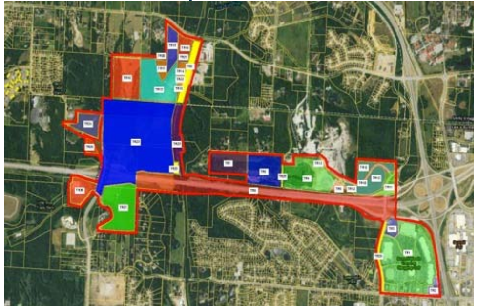
Exhibit B – District Boundaries