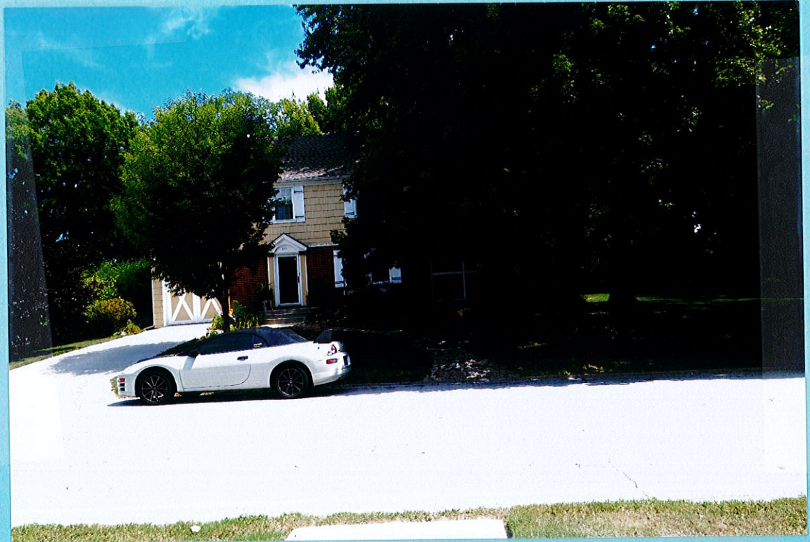
East (201 SW Madison St.)