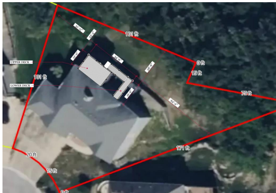
Figure 4 - Plot plan showing proposed replacement deck and catwalk shaded in red. Stairs shown with hatching.