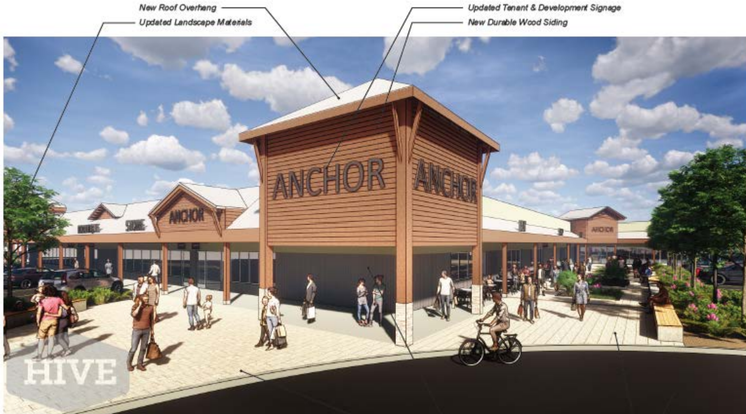
3D Rendering - View from SE Corner Drop-off