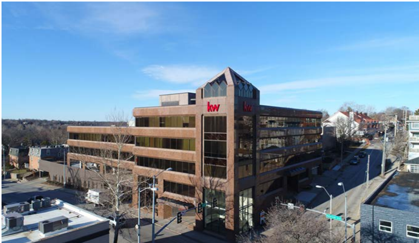
West Plaza Tower