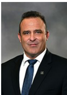
Mayor Bill Baird