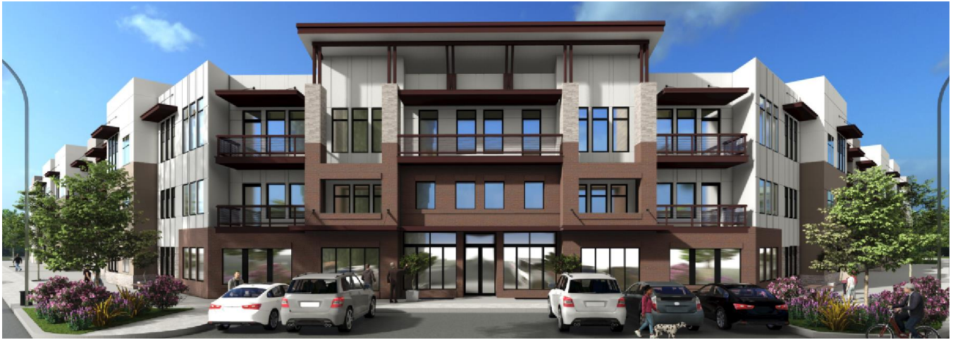
Figure 1 – BLDG 1 Front Elevation