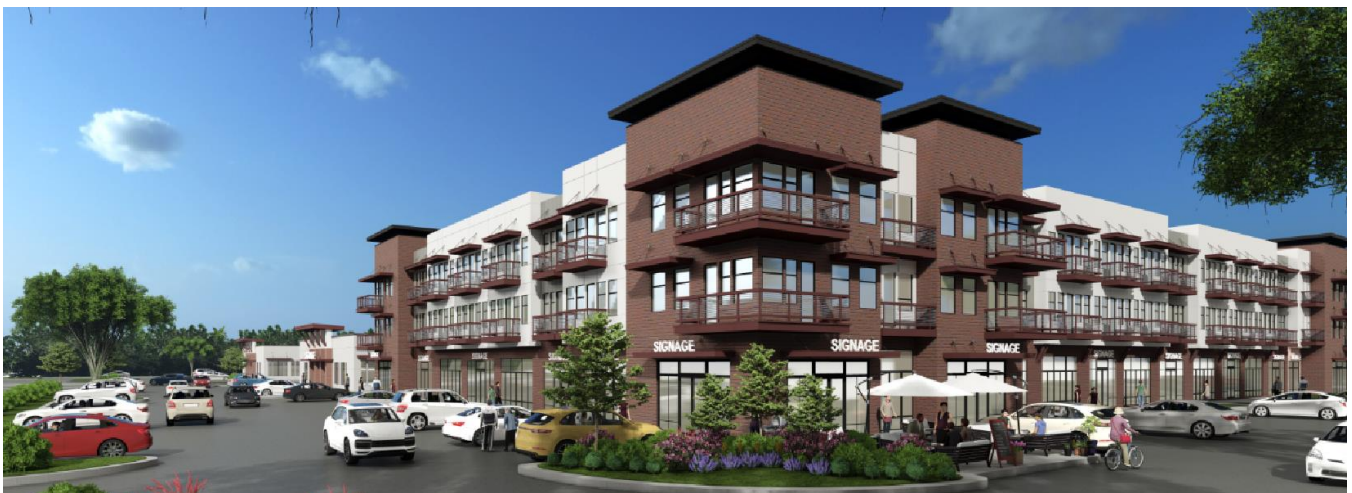
Figure 2 – BLDG 4 North & West Elevations