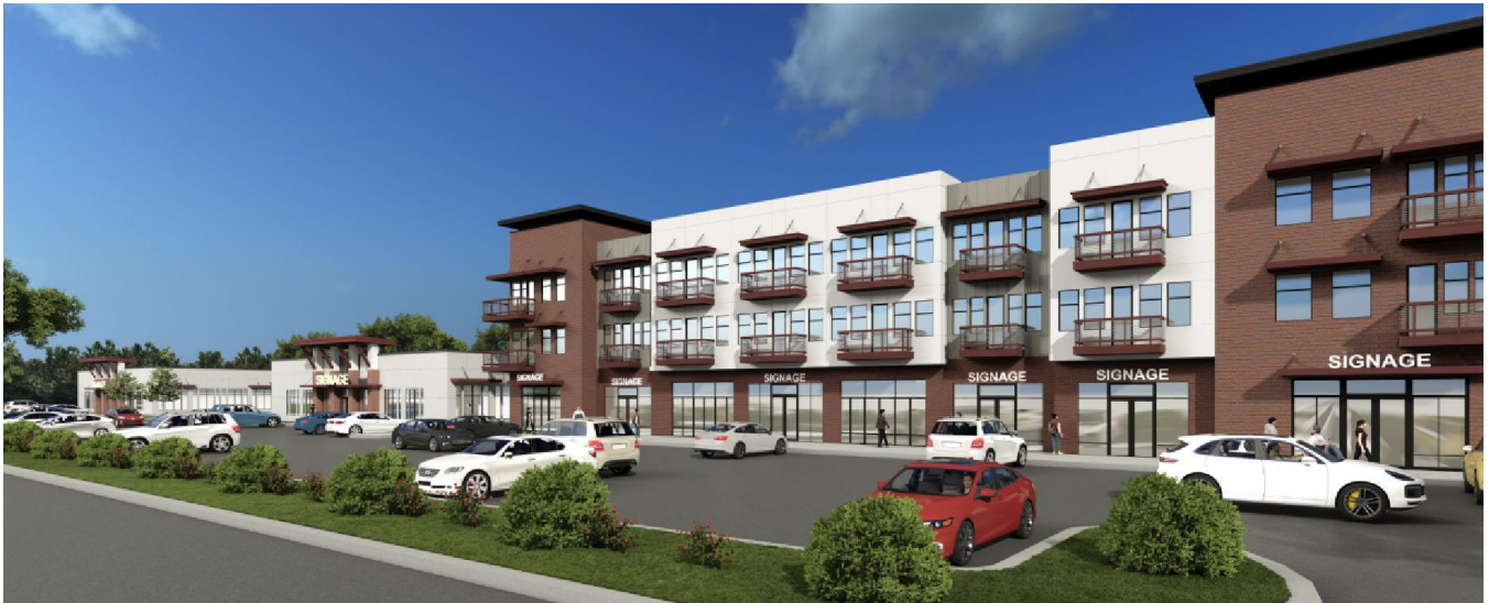
Figure 2 – BLDG 4 North Elevation