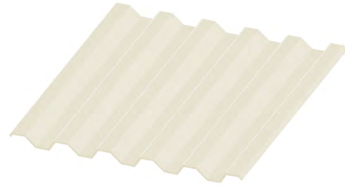
HORIZONTAL METAL WALL PANEL (COLOR/PROFILE): MBCI, SIGNATURE 300 COLOR: 'ALMOND' PROFILE: 7.2 PANEL