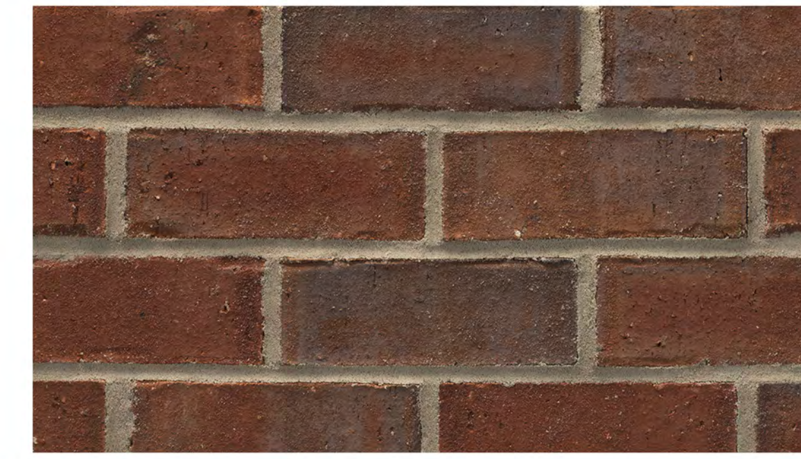
BRICK VENEER: ACVE BRICK MEXAYVA OR SIMILAR