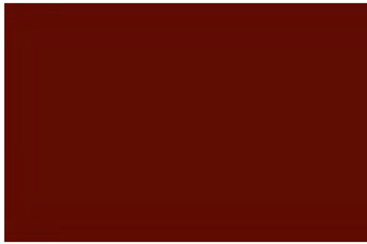
EXTERIOR ROLL UP DOORS (MATERIAL/FINISH): JANUS INTERNATIONAL COLOR: CEDAR RED