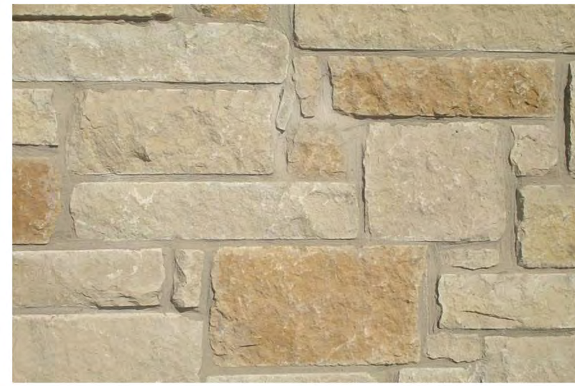
STONE VENEER: COBRSTONE ANTIQUE LEIDERS 4, 3, 3