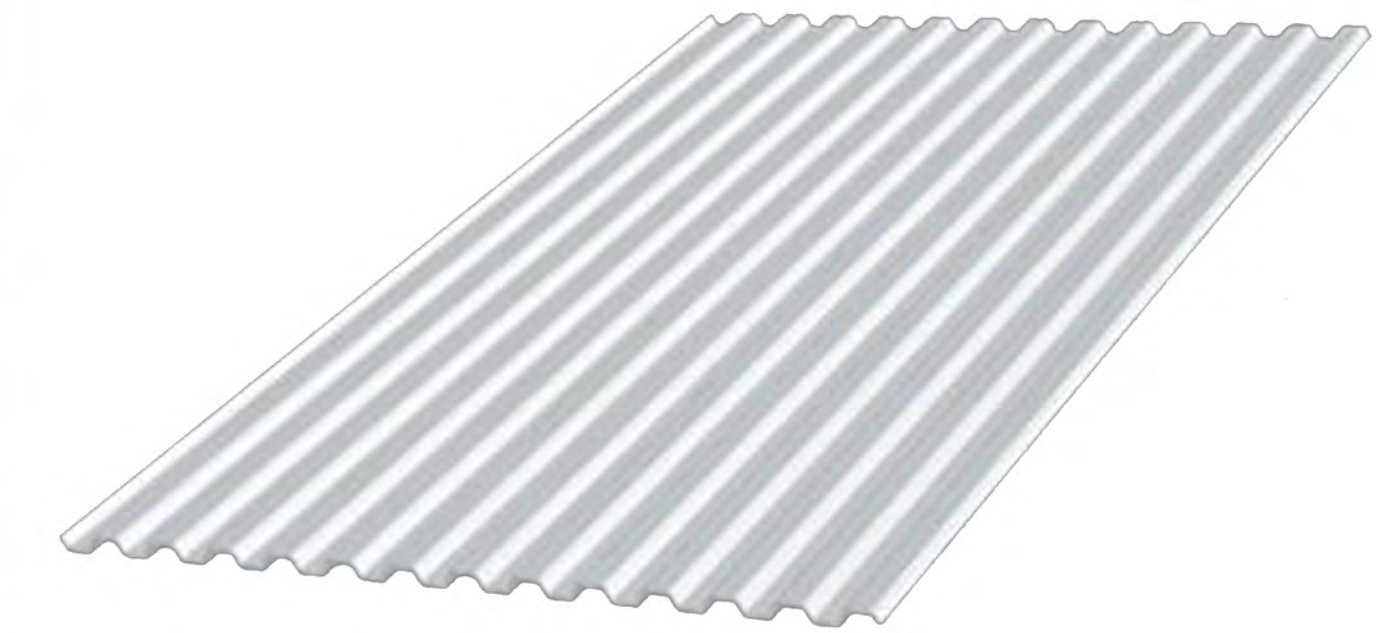
VERTICAL METAL WALL PANEL - BAND: MBCI SIGNATURE 200 COLOR: 'SOLAR WHITE' PROFILE: P60 PANEL