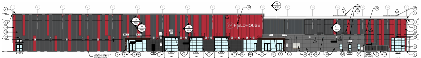
Figure 1 - Renderings of south exterior elevation

The PDP is consistent with the character of the area and is an appropriate use of land in the district. The proposed building will have an upscale warehouse aesthetic that staff believes to be appropriate for an area with a mix of architectural styles and land uses. The material palette for the building includes: architectural metal panels, Nichiha wall panels, concrete and glass store fronts.