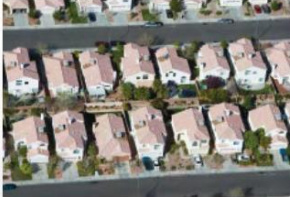
Las Vegas, NV 8.0 units / acre