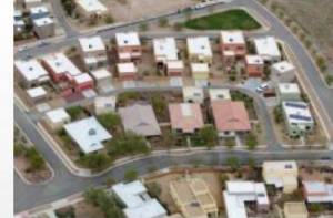
Tucson, AZ 8.1 units / acre