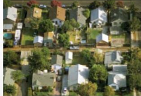
Fresno, CA 8.1 units / acre