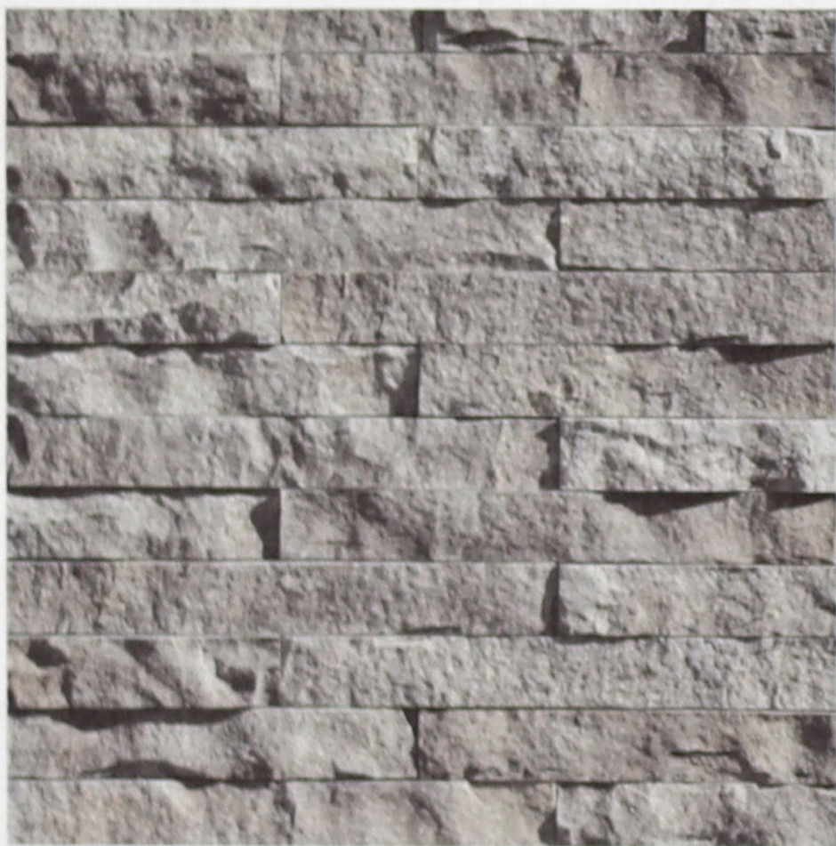
CULTURED STONE: CST-1