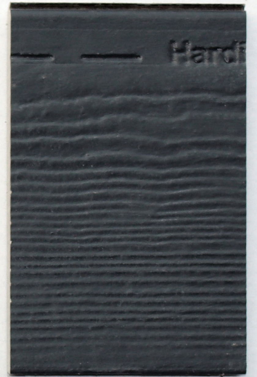
FIBER CEMENT SIDING: FCS-2