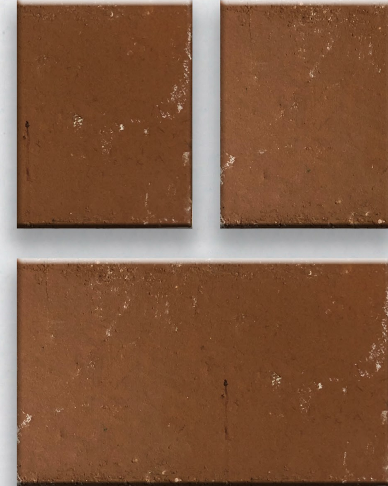
BRICK: BR - 3