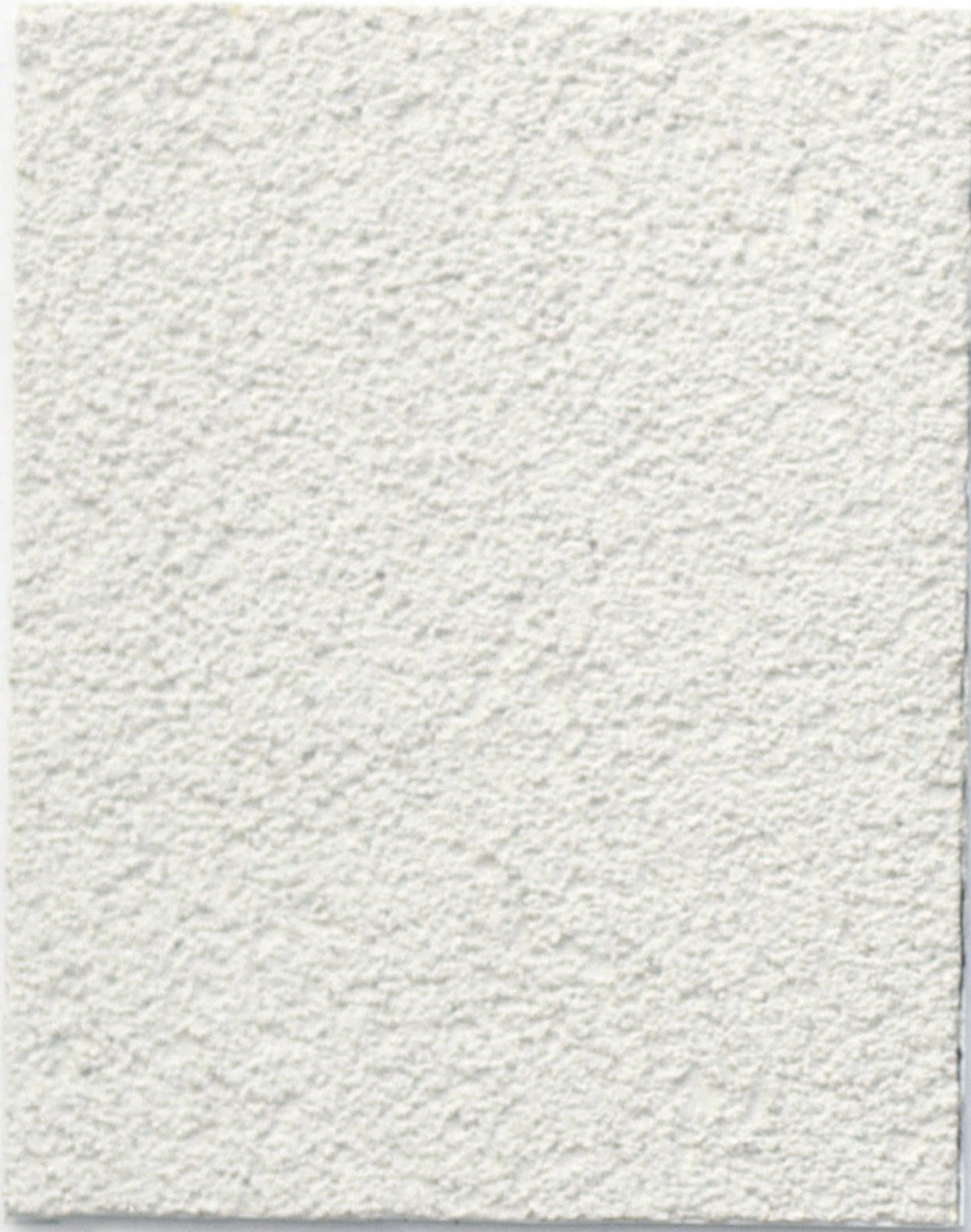
EXTERIOR INSULATION FINISH SYSTEM: EIFS-1