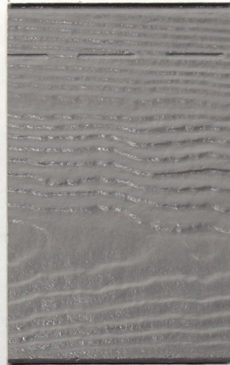
FIBER CEMENT SIDING: FCS-1