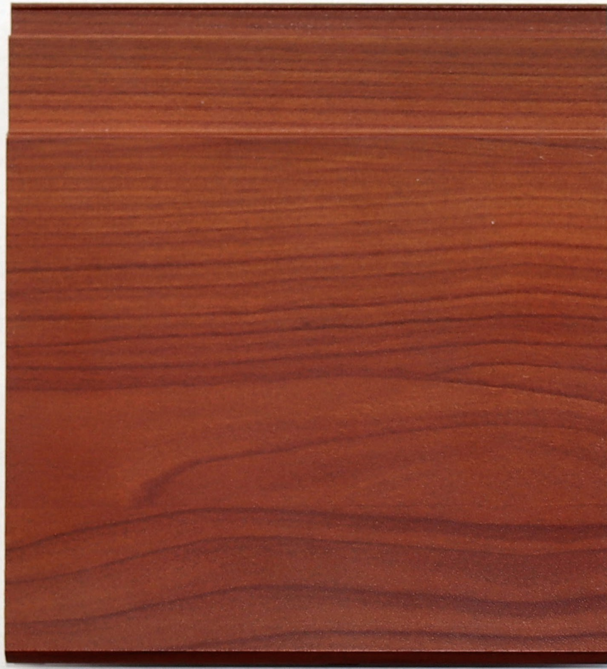
ALUMINUM SIDING: AS-1