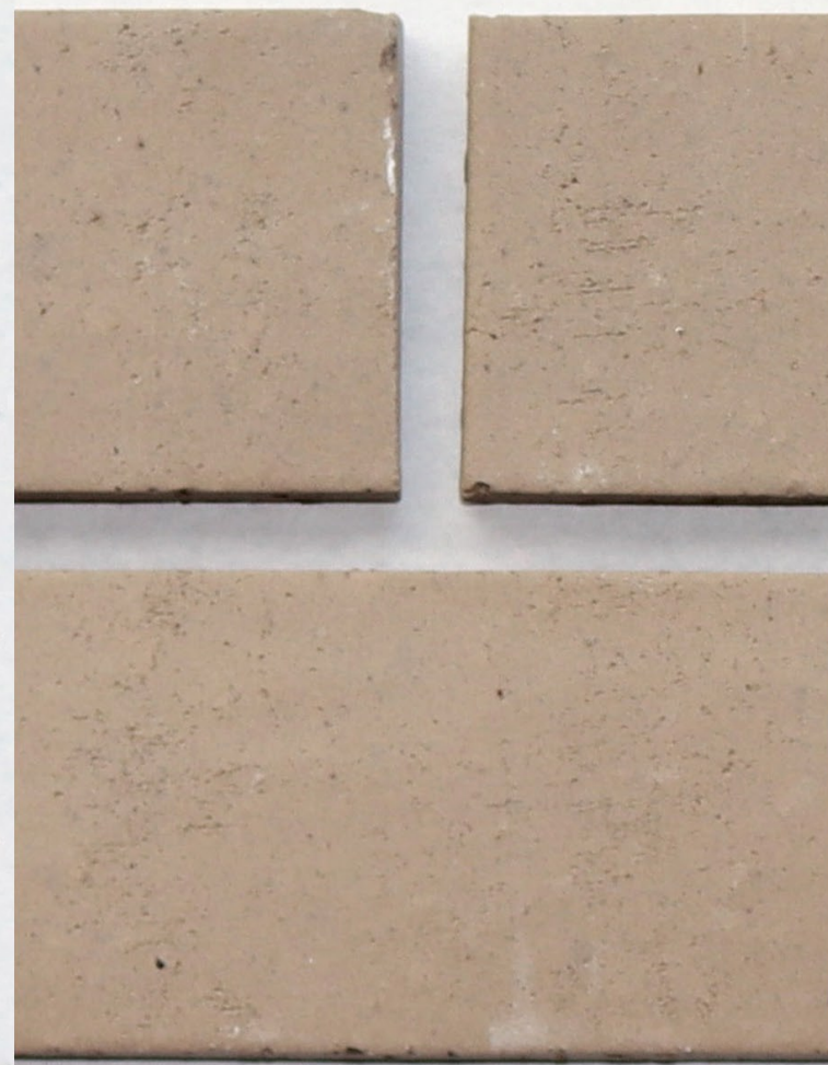
BRICK: BR - 1