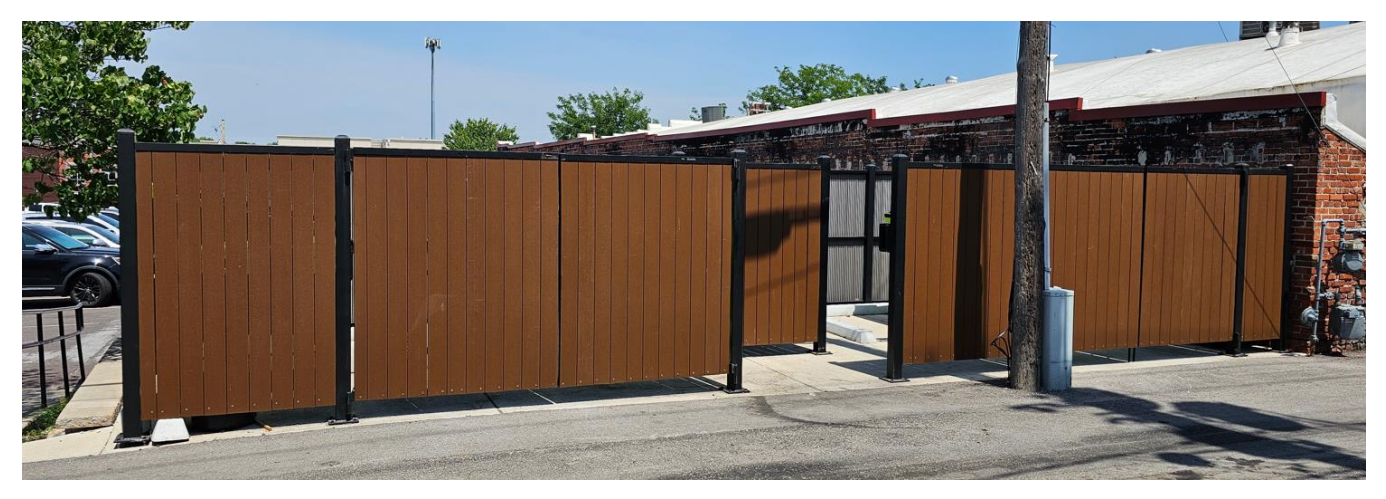
Figure 2 – Trash Enclosure at 216/218 SE Douglas St