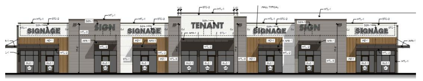
Figure 1 - Renderings of west exterior elevation

The proposed building will have a contemporary aesthetic that staff believes to be appropriate for an area with a mix of architectural styles and land uses. The material palette for the building includes: architectural metal panels, stucco, composite wood panels and glass store fronts.