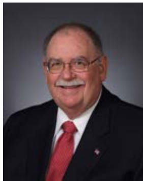
Mayor Randy Rhoads