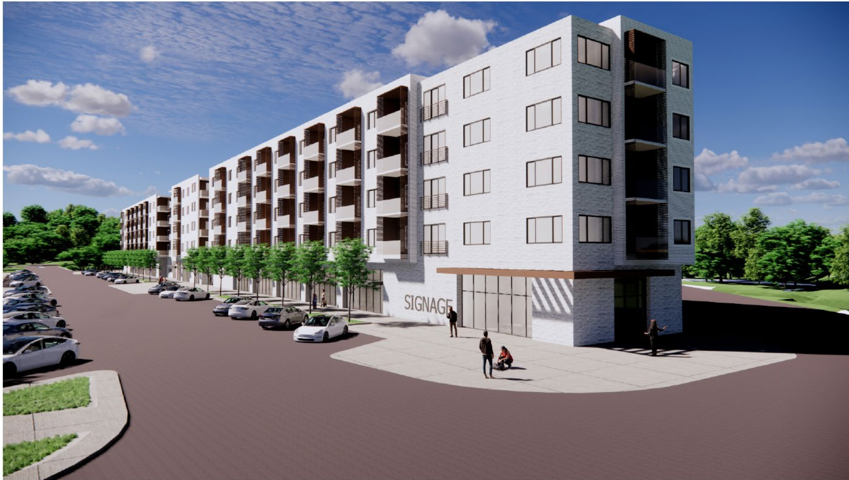
paragon star multi-family exterior concept