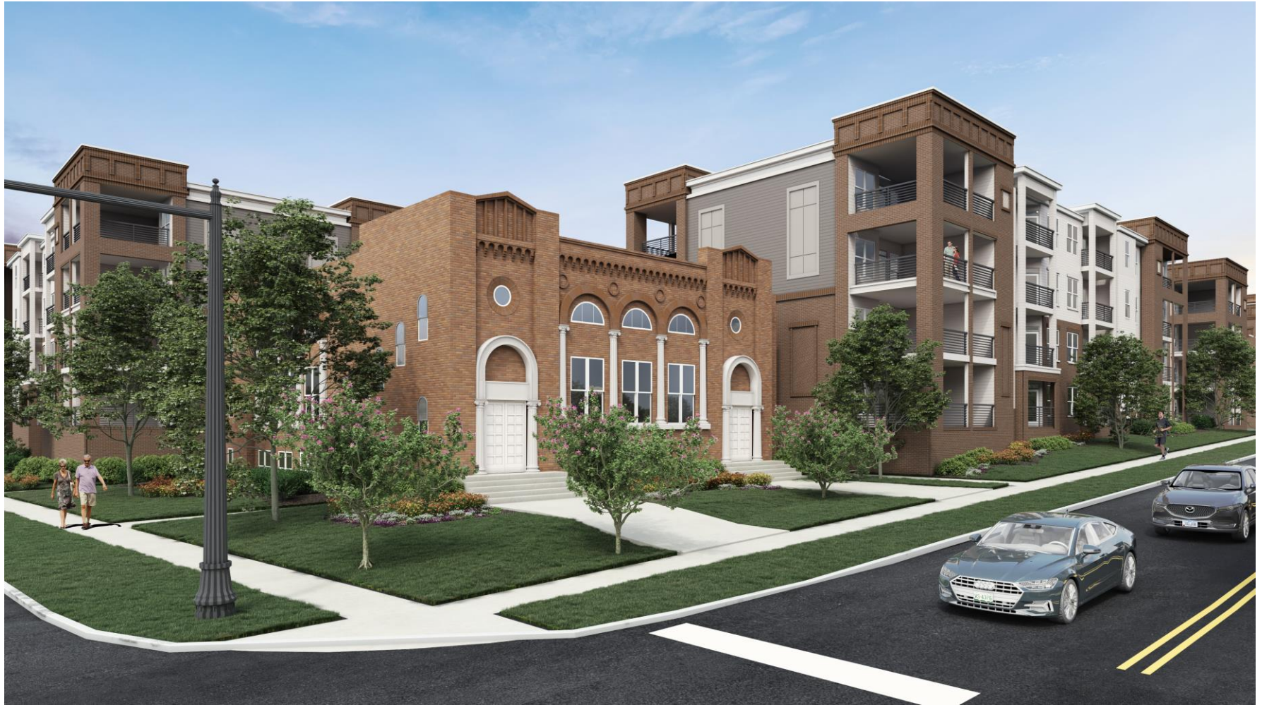
View from 2 nd & Douglas