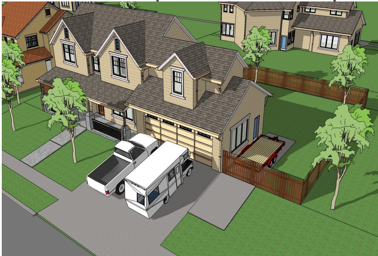
Two Car Garage with Side Yard Pad