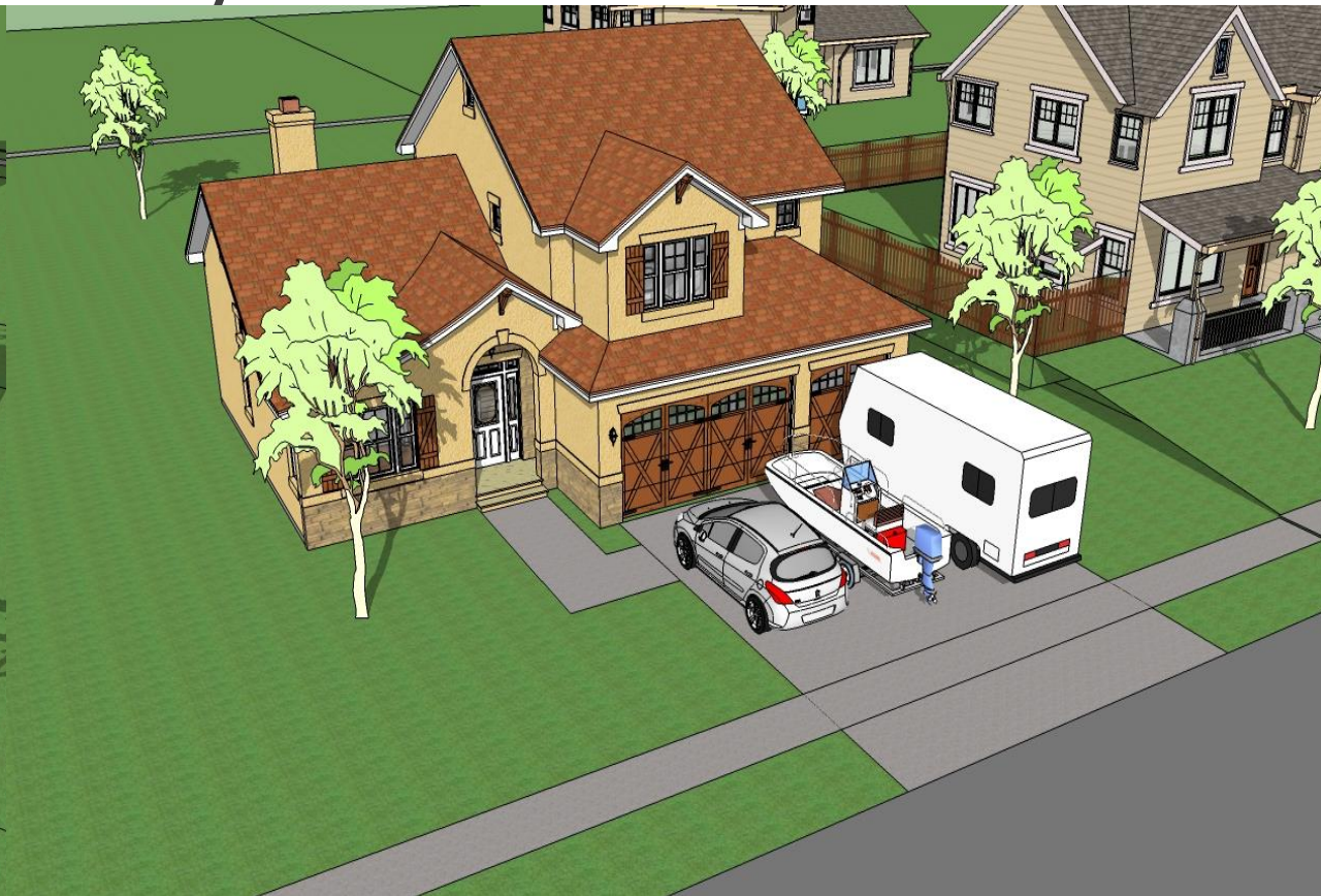
Three Car Garage with two RV's