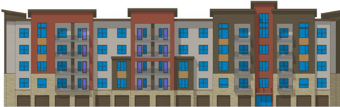
② TYPE D NORTH ELEVATION SCALE: 1/4" = 1'-0"