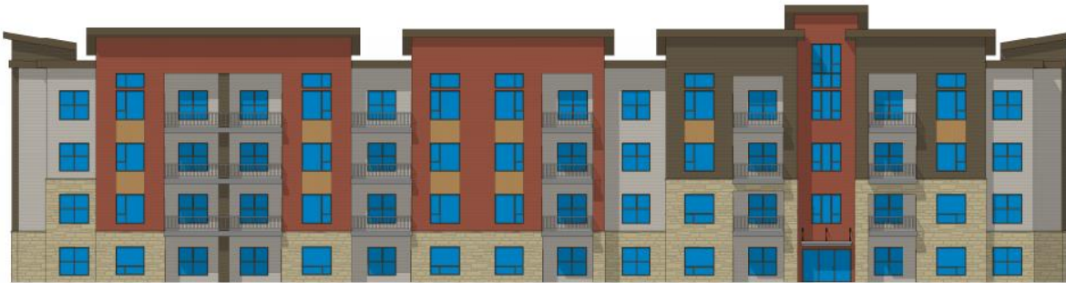
① TYPE D SOUTH ELEVATION SCALE: 1/4" = 1'-0"

ARCHITECTURE INTERIOR DESIGN ARCHITECTURE ENERGY SERVICES P. 913.831.1415 F. 913.831.1563 WWW.NSPJARCHITECTS.COM NSPJ ARCHITECTS. 305 W. 20TH ST., SUITE 201 PRAIRIE VILLAGE, KS 66208