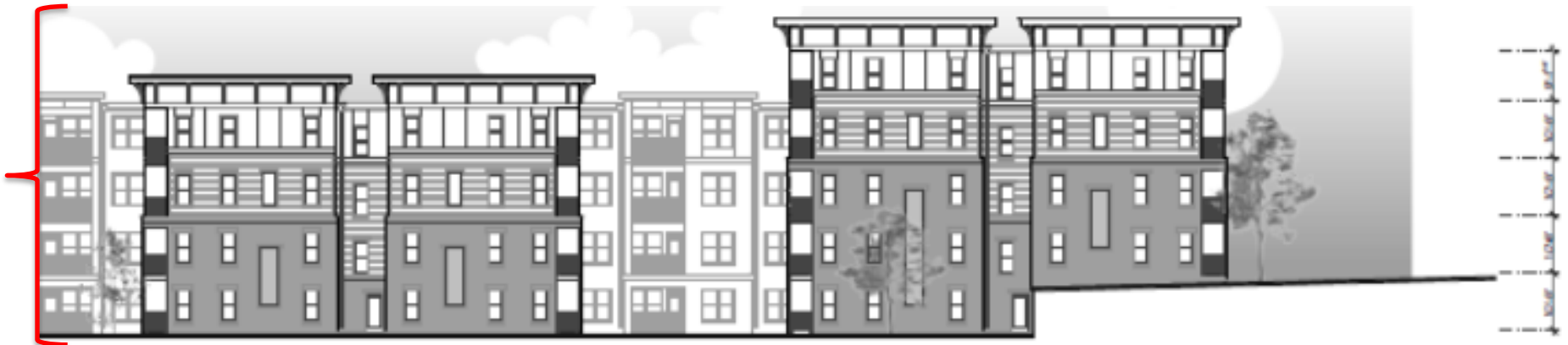
East Elevation Looking West