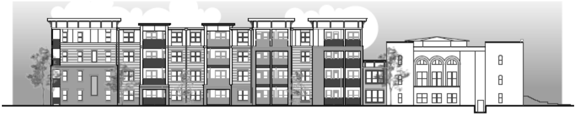
South Elevation Looking North