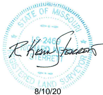
R. KEVIN STERRETT, MISSOURI LS-2469

Sheet 1 of 1 19-020 Prepared 08-10-20 Prepared By: SPW