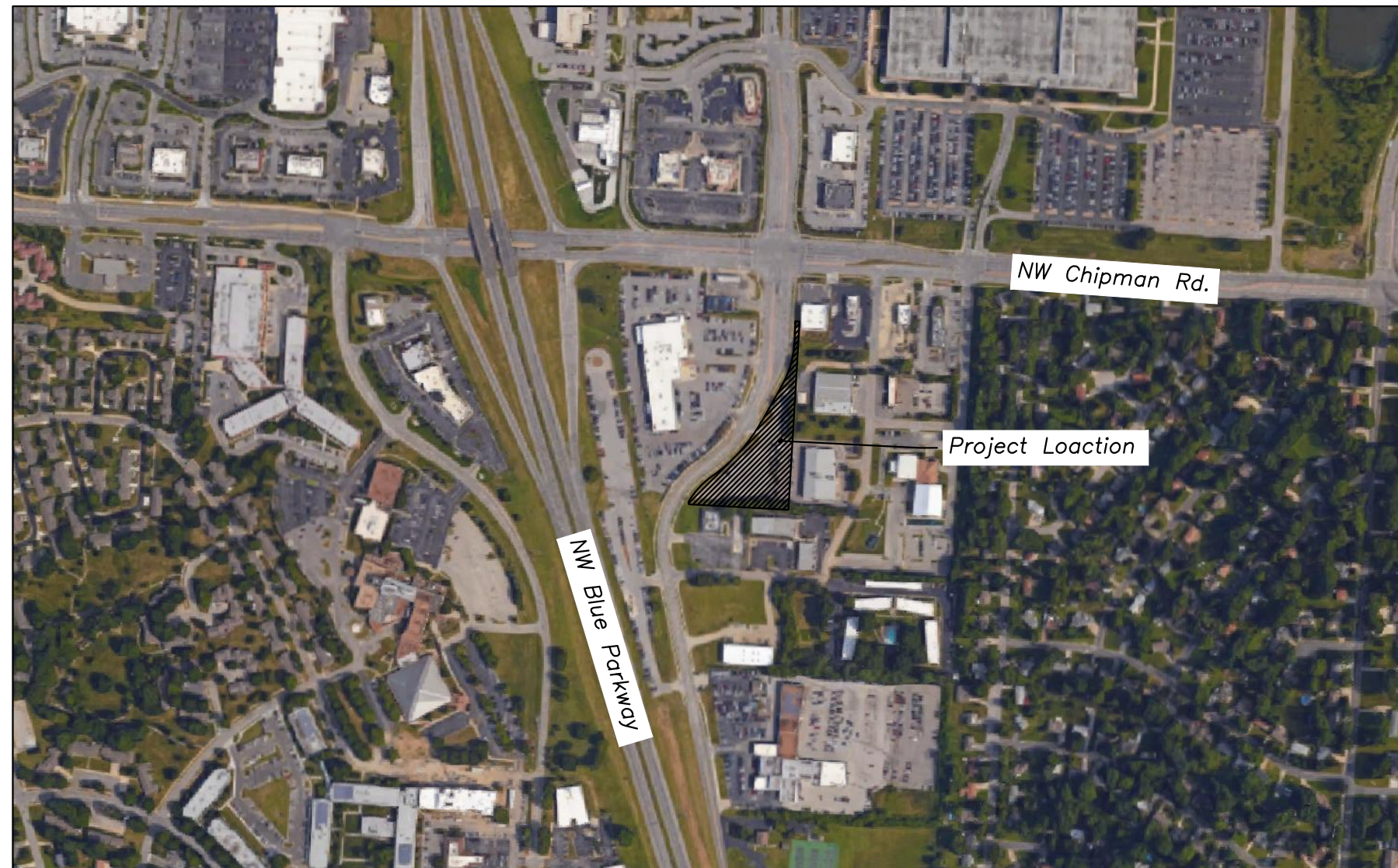
2 Vicinity Map scale: 1"=500' 0 250 500 1000