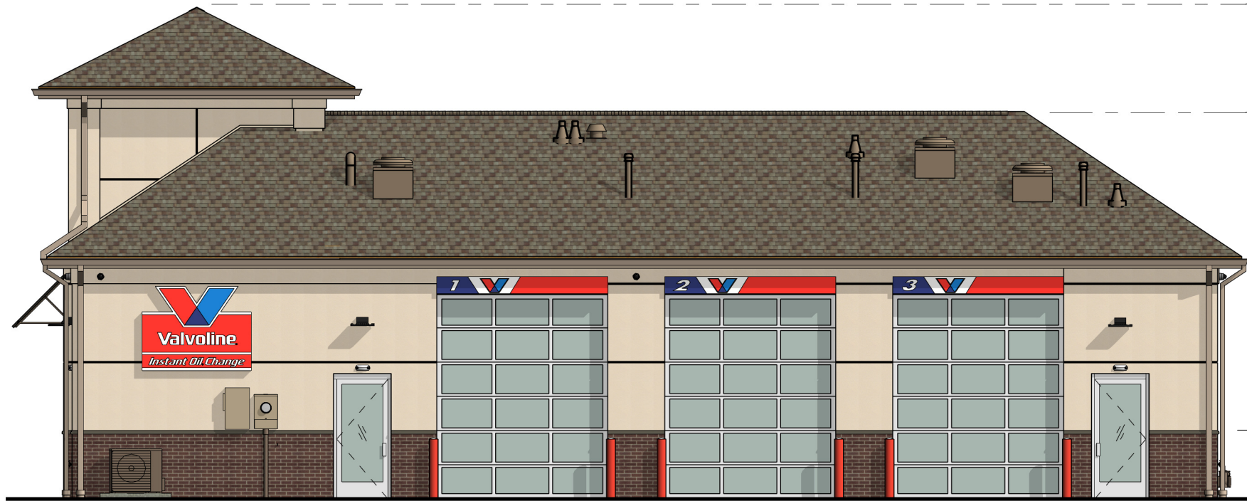
1 OVERALL BACK EXTERIOR ELEVATION Scale: 1/8" = 1'-0"