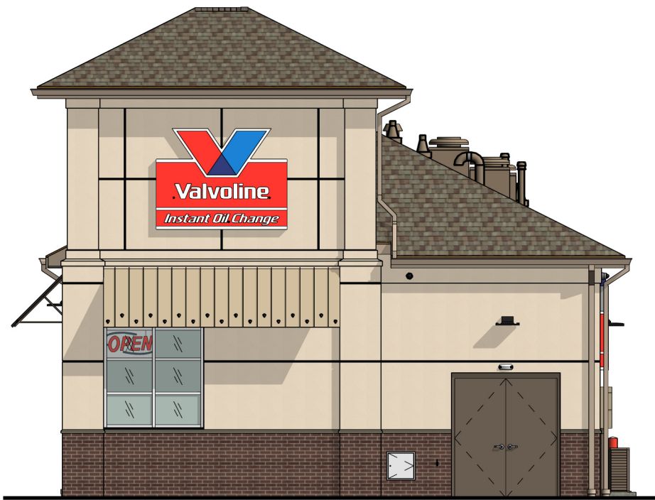
2 OVERALL RIGHT SIDE EXTERIOR ELEVATION (RIGHT) Scale: 1/8" = 1'-0"