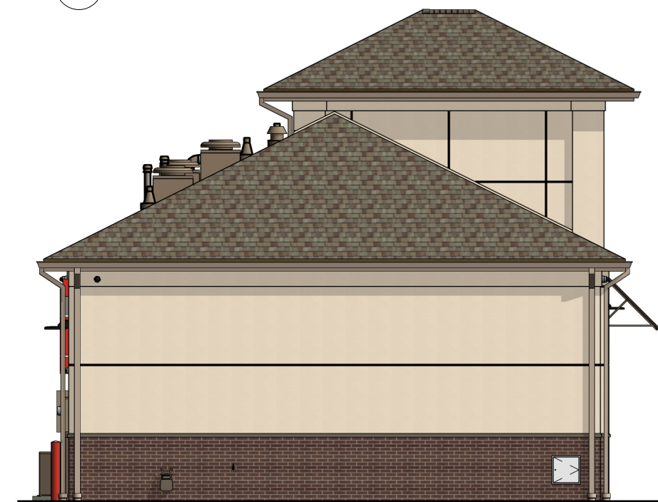
4 OVERALL LEFT SIDE EXTERIOR ELEVATION (LEFT) Scale: 1/8" = 1'-0"