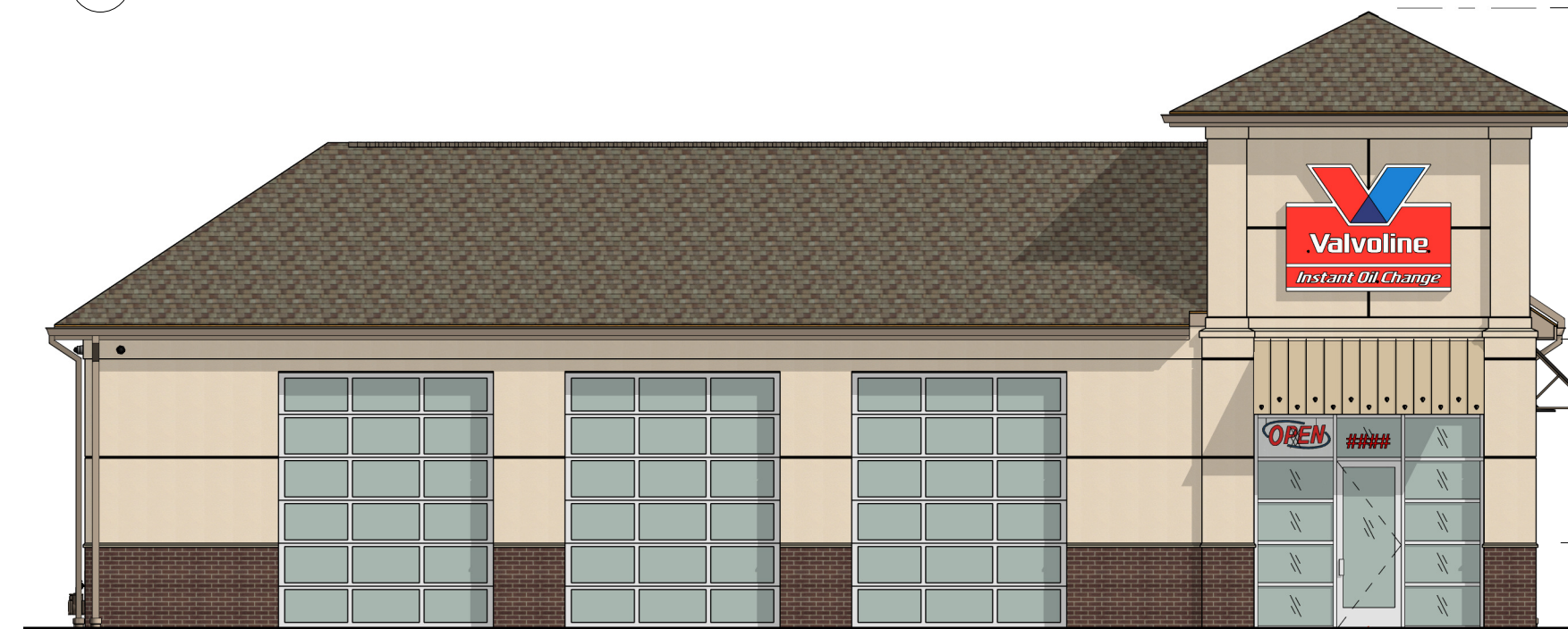
3 OVERALL FRONT EXTERIOR ELEVATION Scale: 1/8" = 1'-0"