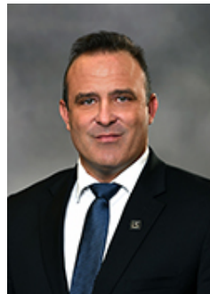
Mayor Bill Baird