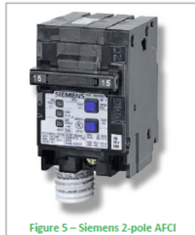
Figure 5 – Siemens 2-pole AFCI

Siemens makes a 2-pole AFCI that includes indicator lights that will tell you if it has tripped from an arc fault or a ground fault, as well as test buttons for each pole (figure 5).