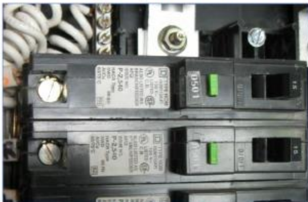
Figure 2 Branch/Feeder AFCI Label

AFCIs cannot detect a “glowing” arc. A high-resistance connection through a conductor can sometimes reach conditions that will ignite adjacent combustible material, and AFCIs will not prevent this. UL states that AFCIs will mitigate the potential effects of electrical arcs, not that it will eliminate them.