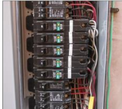
Figure 7 – Eaton AFCIs