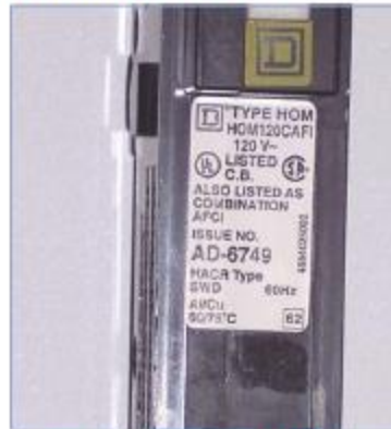
Figure 3 Combination AFCI Label