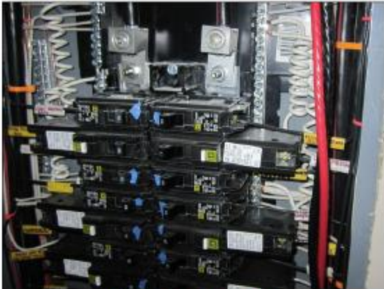
Figure 6 – Square D AFCIs