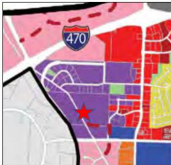
2005 Comp Plan

The proposed 3-lot industrial subdivision is consistent with the land use recommended by the both the 2005 and 2021 Comprehensive Plans for the area. The proposed subdivision meets the objectives of the Comprehensive Plan as it is establishing a well-defined land use for the property that is consistent with the surrounding character of the neighborhood.