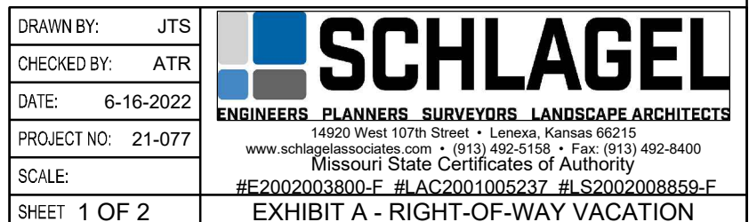
EXHIBIT A - RIGHT-OF-WAY VACATION

I:\PROJECTS\2021\21-077\2.0 Survey\1.0 Esmts-Legals\21-077 ROW VACATION EXHIBIT.dwg, 8.5x11-P, 6/16/2022 9:36:13 AM