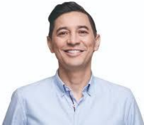
Mayor of Ibagué Andrés Fabian Hurtado

“We are hoping to strengthen our ties of brotherhood to obtain and increase between cities and strategic allies.”