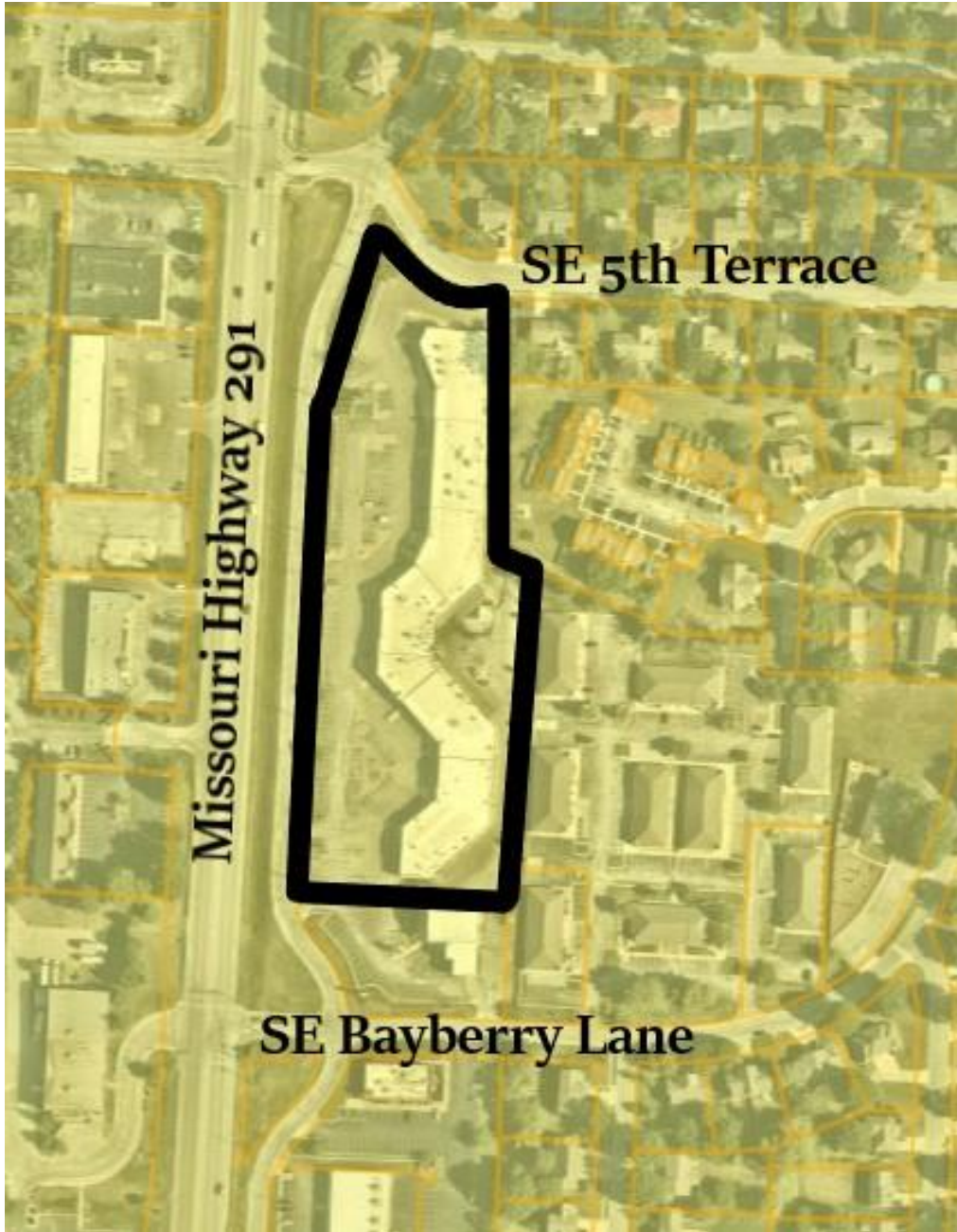
General Boundary Map of the Bayberry Crossing Community Improvement District