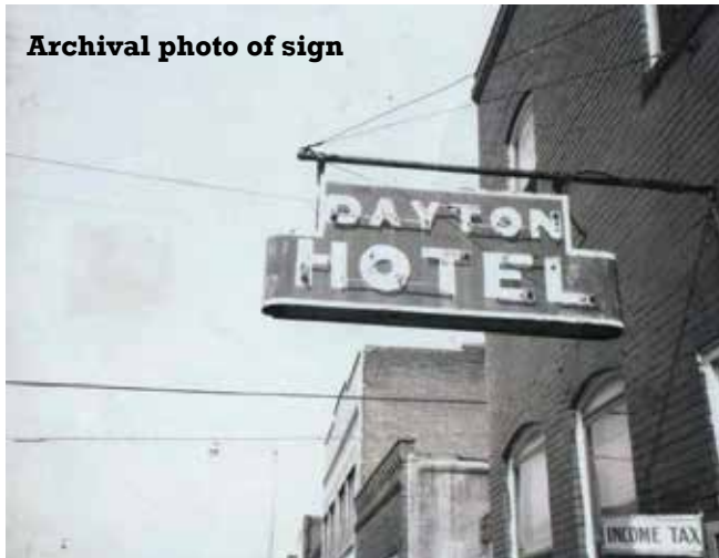
Archival photo of sign

The Dayton Hotel existed in downtown Lee's Summit for decades. It's iconic neon sign could be seen along Third Street. Our research shows the sign was probably made here in Lee's Summit. For certain, it was maintained over the years by Summit Neon Signs. After the hotel closed, the sign was removed in the early 1990s. For more than 25 years the sign gathered dust. The building's new owner recovered the sign and began restoration. We have replaced and upgraded the neon tubing/insulators and the internal electrical systems. In addition, we have strengthened the steel sign framework. It is ready to shine again.