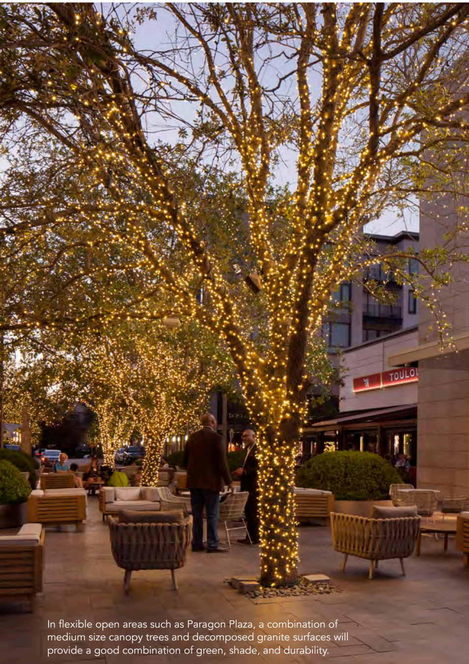
In flexible open areas such as Paragon Plaza, a combination of medium size canopy trees and decomposed granite surfaces will provide a good combination of green, shade, and durability.