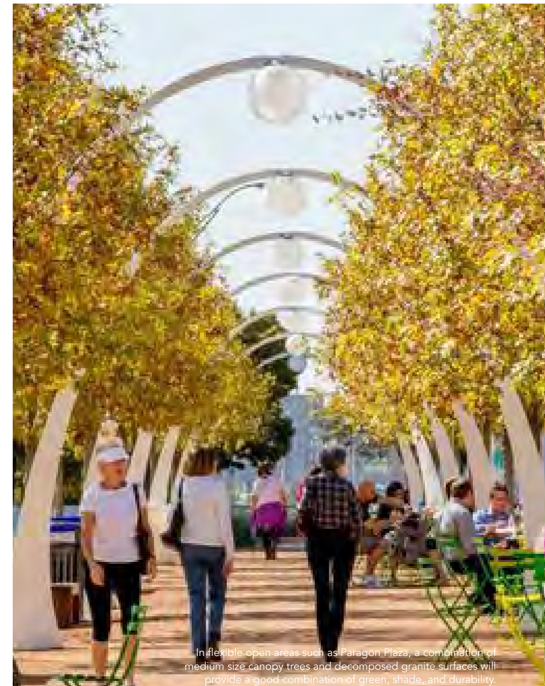
In flexible open areas such as Paragon Plaza, a combination of medium size canopy trees and decomposed granite surfaces will provide a good combination of green, shade, and durability.