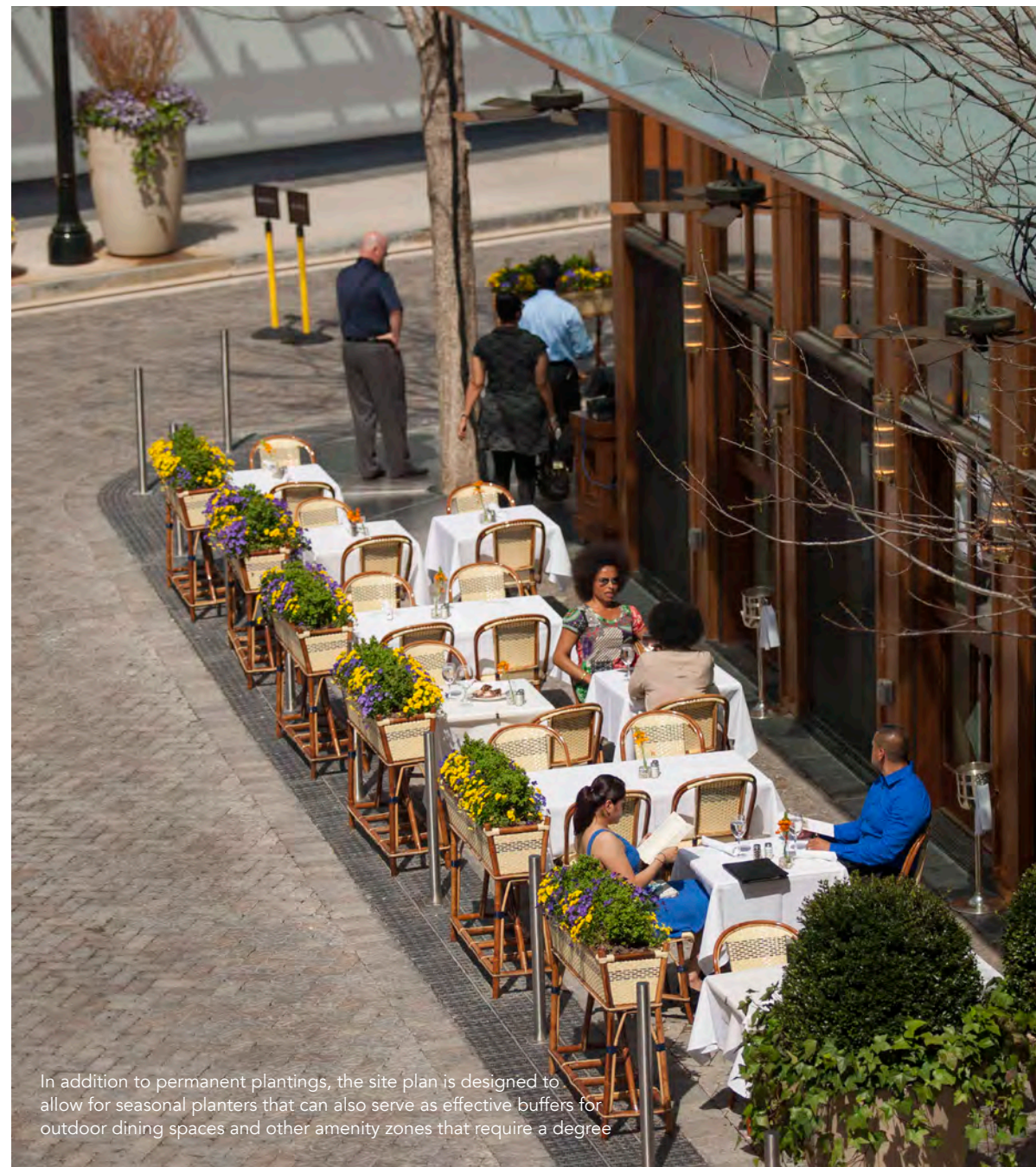
In addition to permanent plantings, the site plan is designed to allow for seasonal planters that can also serve as effective buffers for outdoor dining spaces and other amenity zones that require a degree