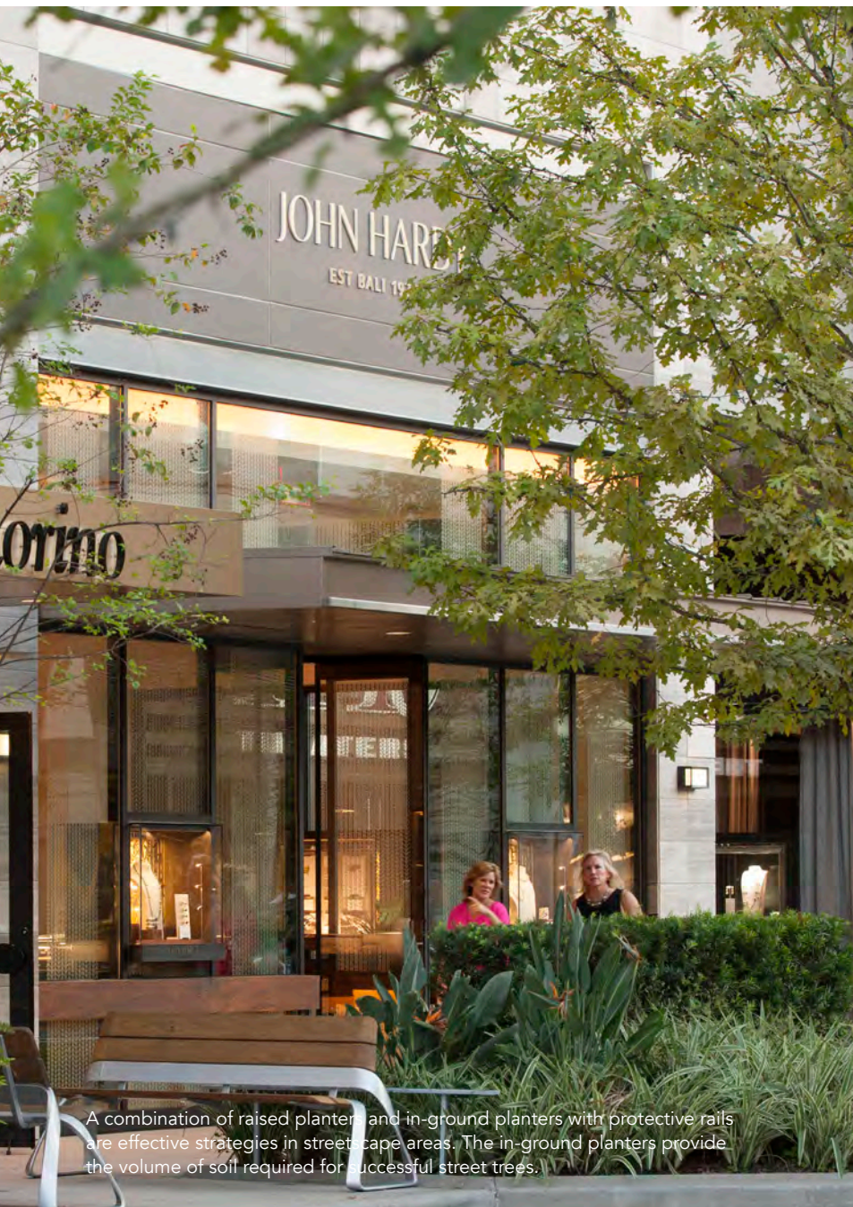
A combination of raised planters and in-ground planters with protective rails are effective strategies in streetscape areas. The in-ground planters provide the volume of soil required for successful street trees.