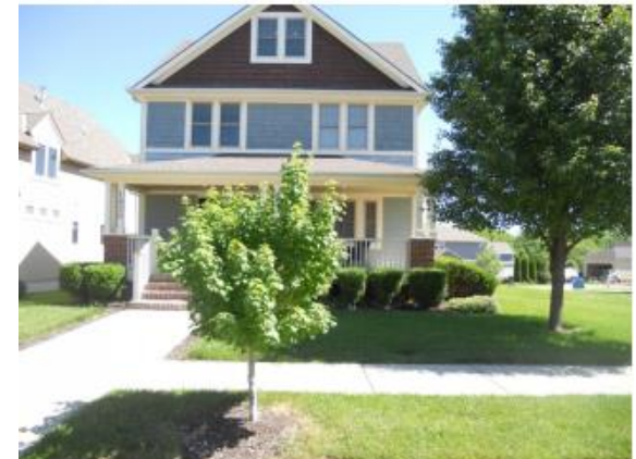
1820 SW Napa Valley Drive (Lot 45, Napa Valley 1 st Plat)