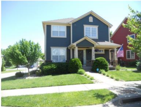
1836 SW Napa Valley Drive (Lot 42, Napa Valley 1 st Plat)