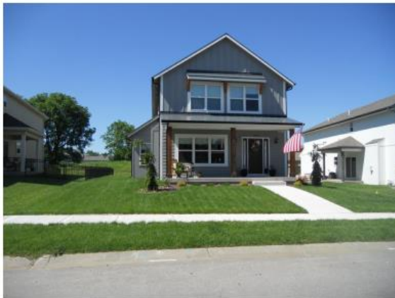
1833 SW Napa Valley Drive (Lot 30, Napa Valley 1 st Plat)