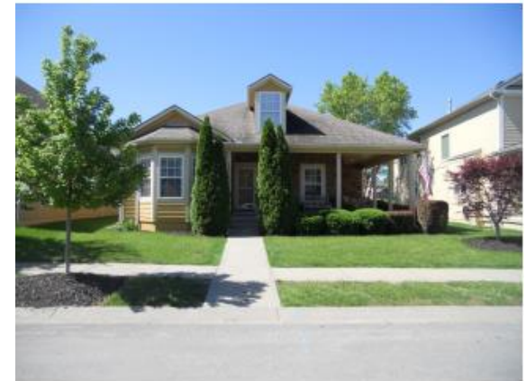
1825 SW Napa Valley Drive (Lot 32, Napa Valley 1 st Plat)