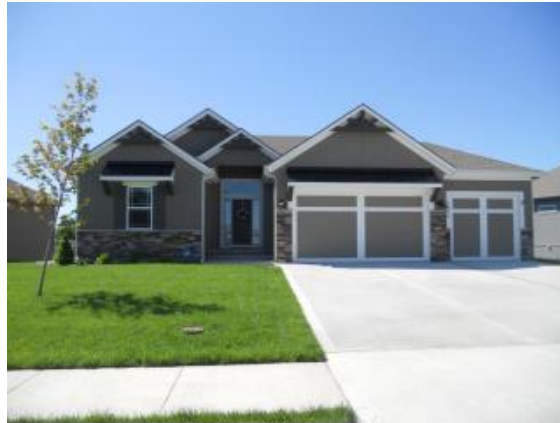
1611 SW Blackstone Place (Lot 138, Napa Valley 3 rd Plat)