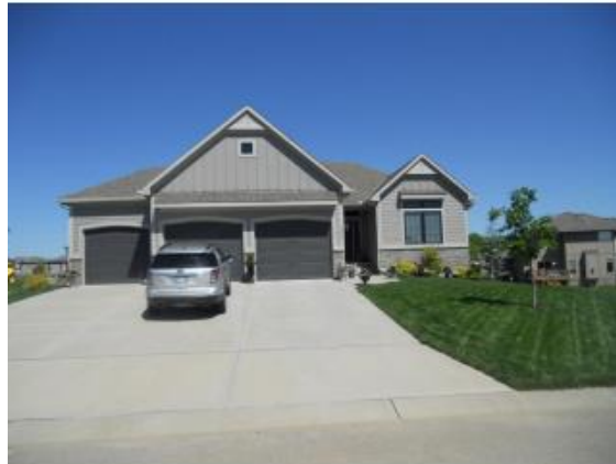
1622 SW Blackstone Place (Lot 124, Napa Valley 3 rd Plat)