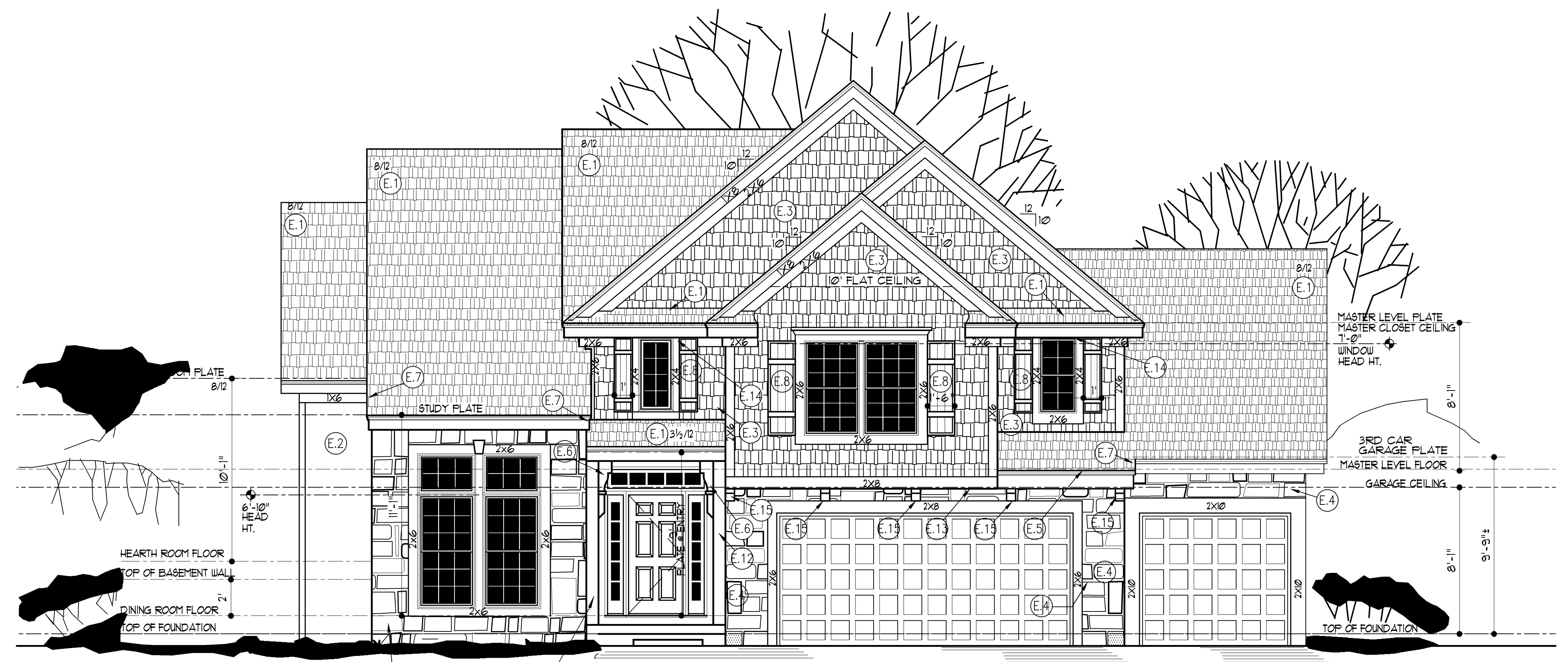
1 FRONT ELEVATION 1/4" = 1'-0"