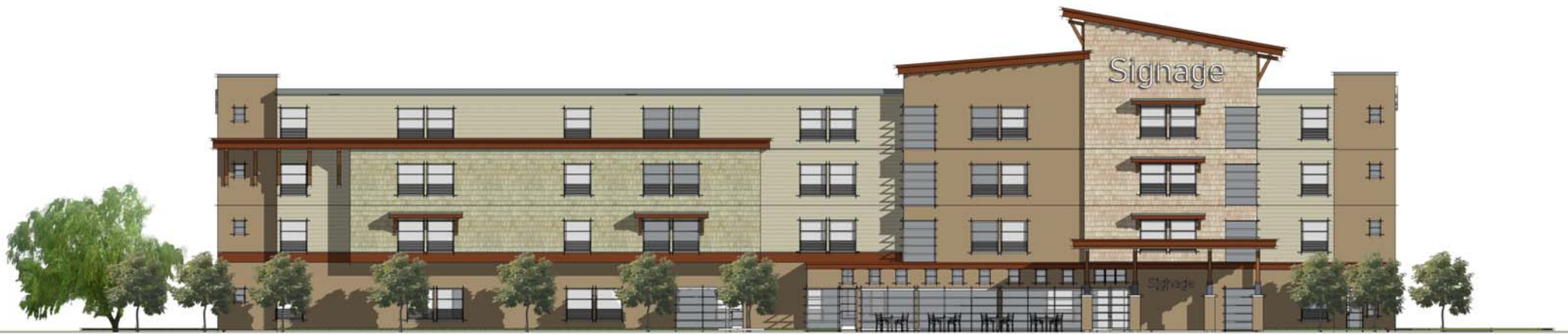
Hotel Streets of West Pryor East Elevation