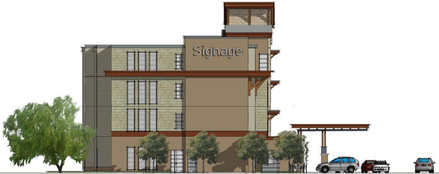
Hotel Streets of West Pryor South Elevation