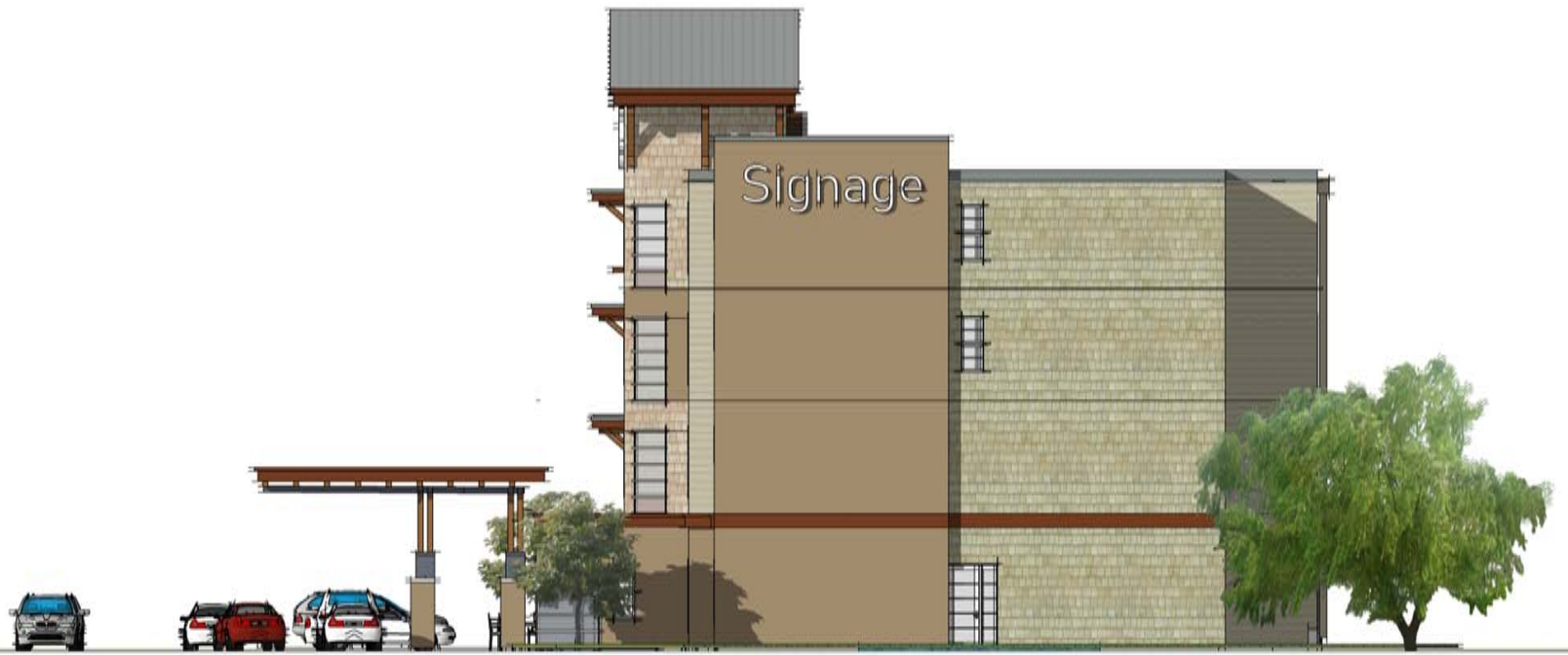
Hotel Streets of West Pryor North Elevation