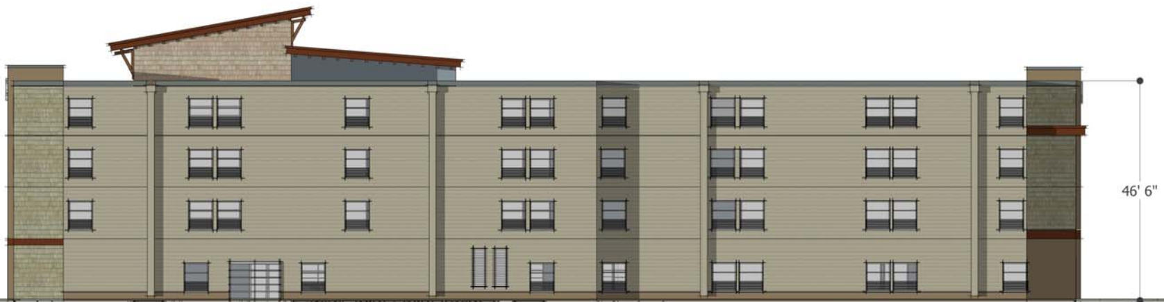
Hotel Streets of West Pryor West Elevation