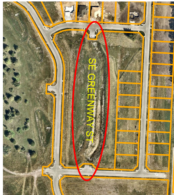
2022 AERIAL SHOWING NO AFFECTED PROPERTY OWNERS

SE COBEY LANE WAS PLATTED WITH COBEY CREEK 1ST PLAT. THE STREET ITSELF WAS NOT INTENDED TO BE CONSTRUCTED UNTIL COBEY CREEK 2ND PLAT. TWO EXSITING STREET STUBS WILL BE CONNECTED WITH PHASE 2 CONSTRUCTION. A NEW DEVELOPER OWNS THE DEVELOPMENT AND WISHES TO RENAME "SE COBEY LANE" TO "SE GREENWAY STREET". NO PROPERTY OWNERS WILL BE AFFECTED BY THE CHANGE.