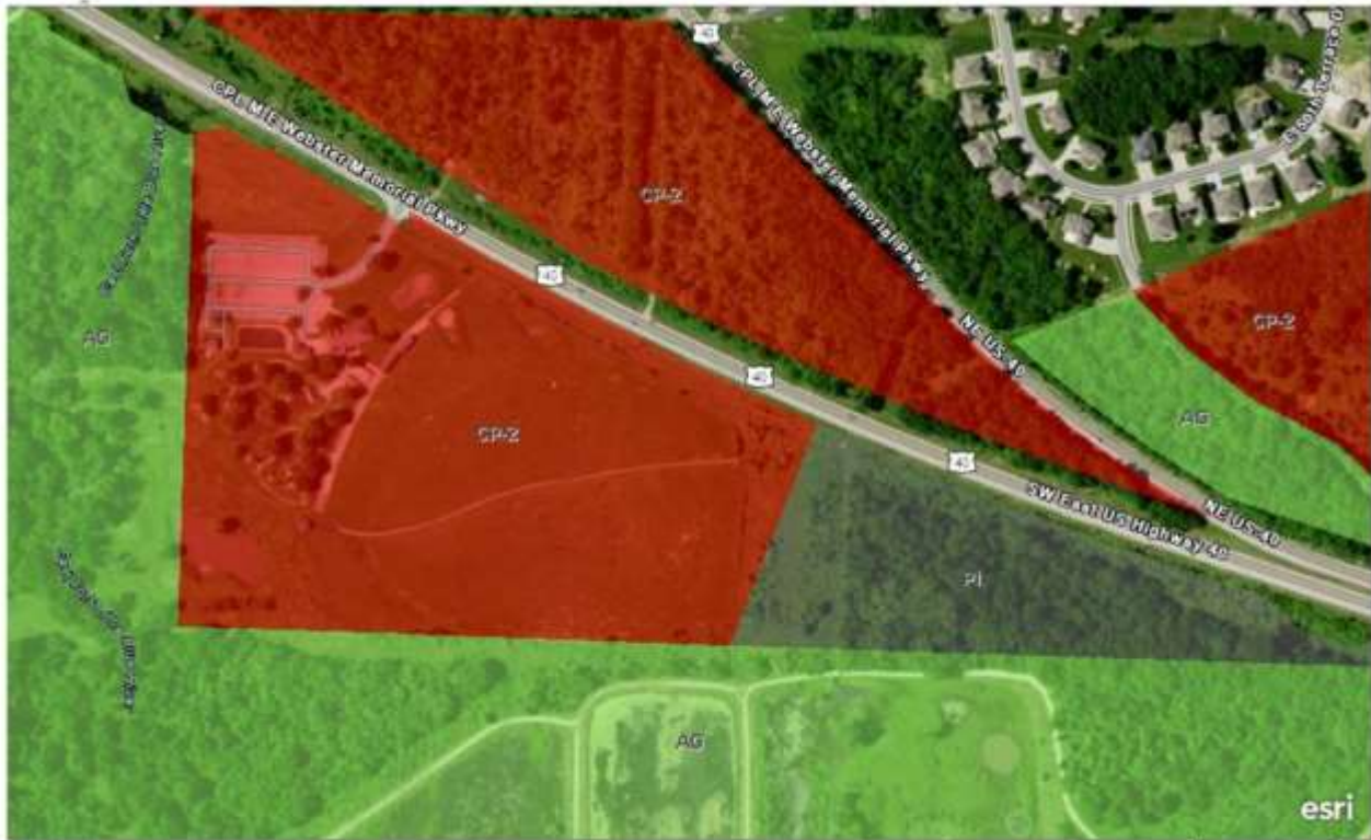
Displays the zoning designation for properties in Lee's Summit, MO